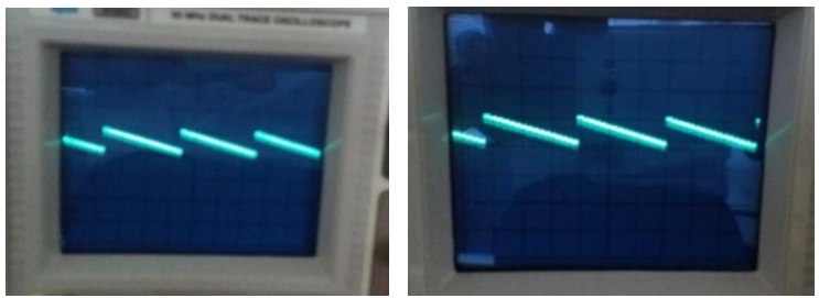
Fig 2: RAMP output

The circuit which produce output and it can be seen in multimeter as well as cathode ray oscilloscope. The output seen in multimeter is shown in above table 1 and corresponding output observed in CRO is shown in bellow figure 2. The resulted output is staircase and in generally we can see ramp output in CRO. In this paper, we have presented a ramp generator. Ramp output generate when inputs are passed to DAC0800 through IC74393 and successfully verified.